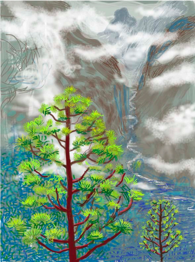
David Hockney, Untitled No. 1 from The Yosemite Suite