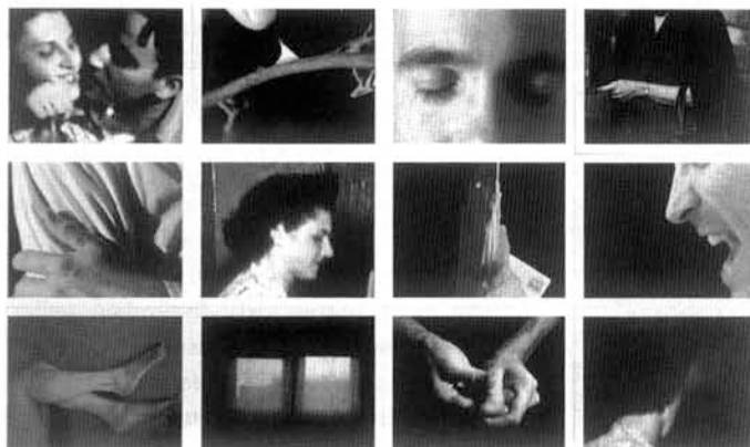
I'll Give You Something to Cry About (1998) by Eileen Cowin; © Eileen Cowin; courtesy the artist

JODY ZELLEN is an artist and writer based in Los Angeles.