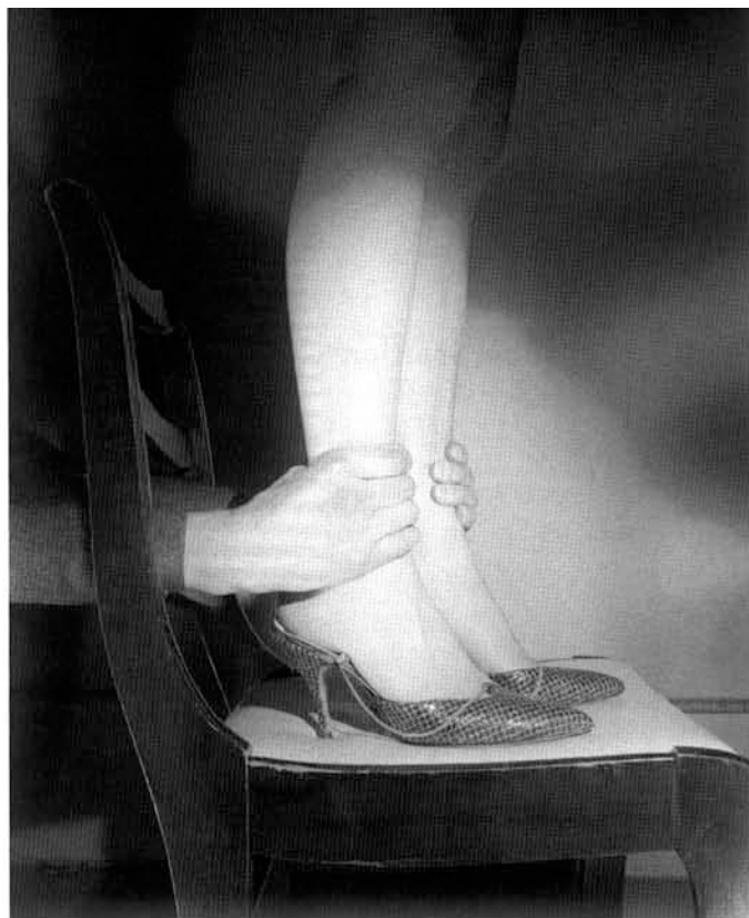
Hands on Ankles (1976–77) by Jo Ann Callis; © Jo Ann Callis; courtesy the artist/Rose Gallery

If Cowin is the realist and Brooks the inventor, then Callis is the surrealist. Her works are as much about what is impossible as what could happen. Callis plays with foreground/background relationships in images such as Woman Twirling and Man and Plant (both 1985). In these two photographs, the figure is purposely out of focus, caught in the midst of an action—woman twirling, man laughing and throwing his head from side to side. Both images are shot in what appears to be a domestic space, the subject's restlessness suggesting a need to escape. The desire to obfuscate domestic space and motherly roles was paramount for Callis at this time. In Dish Trick (1985), dishes are caught in mid-flight as a yellow tablecloth beneath them is yanked away by an unidentified person. The gesture, a purposefully destructive